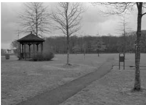
Turnpike Park Pathway will connect to the Woods Road Park Pathway pictured above.

Grant funds will be used to purchase the trail surface material, signage, benches, and crushed stone for a small parking area near the entrance and some equipment use. The project is scheduled to be completed in July.